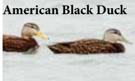
American Black Duck